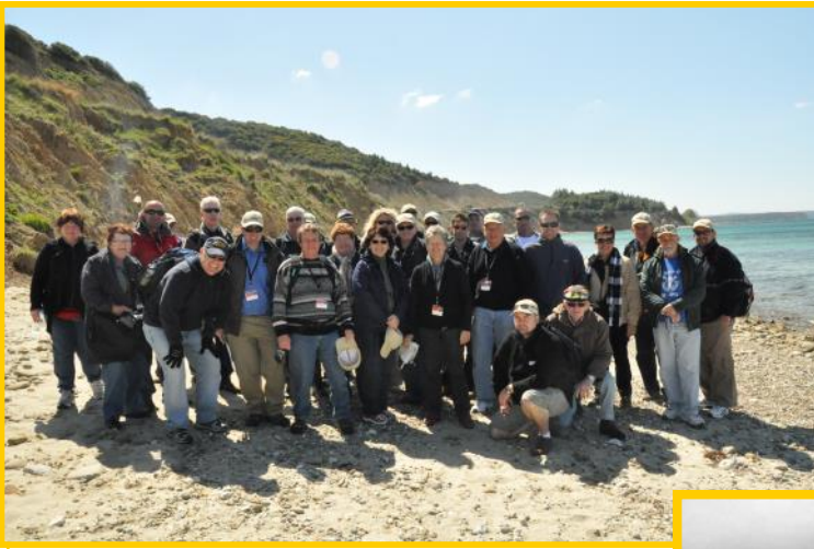
Left: ANZAC Cove - Today. Right: The ANZAC Memorial Below: During the 1915 Landings.