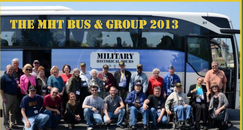
THE MHT BUS & GROUP 2013