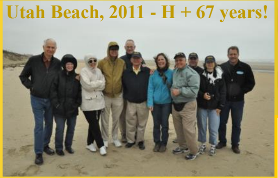
Utah Beach, 2011 - H + 67 years!