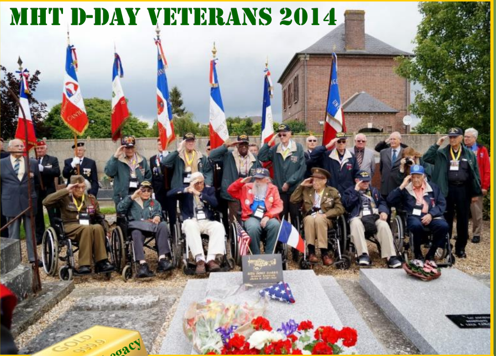
MHT D-DAY VETERANS 2014