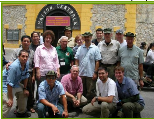
"Gunny" R. Lee Ermey at Hanoi Hilton with MHT!

20 July (Day 6) We start the day with our flight to Da Nang landing near Red Beach where the first ground combat units of the U.S. Marines landed in 1965. We will explore Marble Mountain and see where the VC maintained a secret hospital through-out the war. The adventurous may climb to the top for a panoramic view of the Da Nang Area of operations. We will also visit a marble carving shop before checking into our hotel in the ancient city of Hoi An and a chance to swim at China Beach of the TV show fame. Hotel: Hoi An (B/L/D)